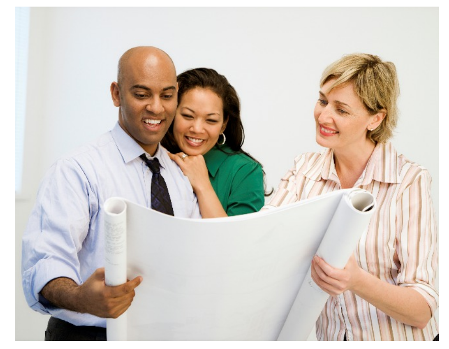
Experience Counts! With decades of experience Encore employees have the know-how to get the job done!