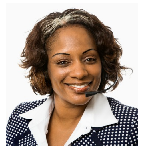
Call for a FREE no-obligation consultation

Optional Accessories - Many building enhancements are available such as wall louvers, reinforced translucent skylights, ridge ventilators, stall systems, and snow guards.